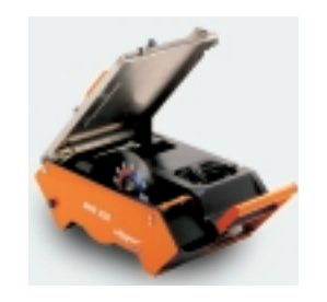
Excellent accessibility for changing blade and for cleaning.