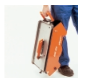
Maschine can be handled with full tank.